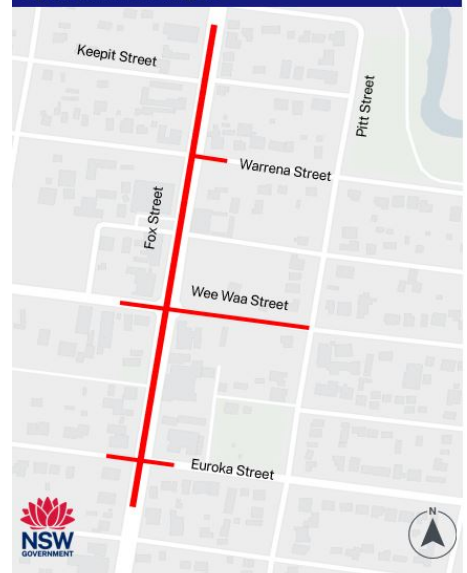
Walgett High Pedestrian Activity Area | Speed limit changes

The speed limit comes into effect from Wednesday 26 June 2024.