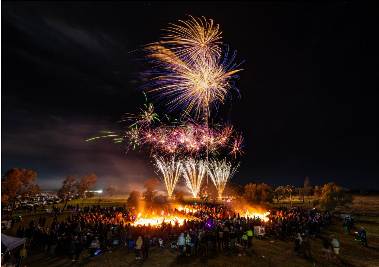
Rowena Cracker Night 2022– David Glazebrook

Council Chambers | Walgett Shire Council 77 Fox Street, Walgett